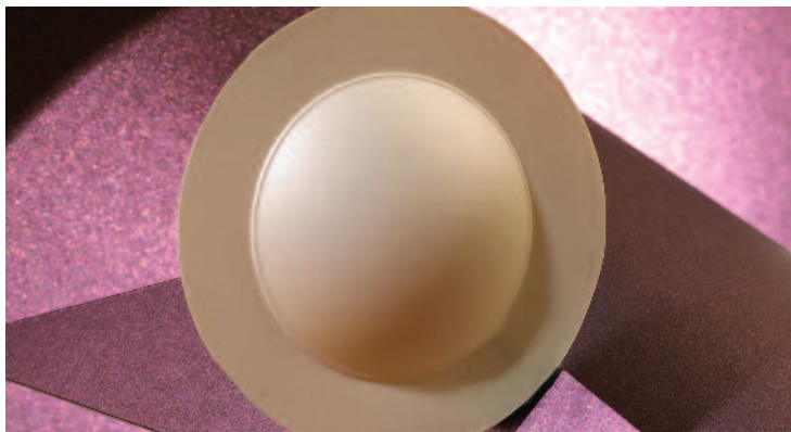
Compression driver diaphragm