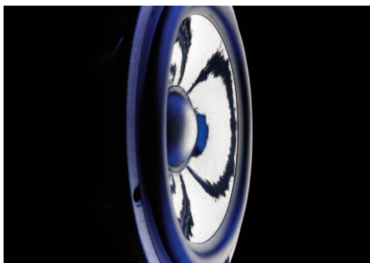
Automotive speaker cone