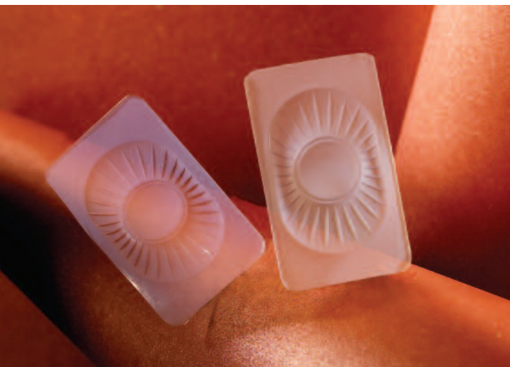
Cell phone speaker diaphragms

APTIV film is available in several grades according to the specific needs of the end use application. Within each grade a broad range of thicknesses are available from 6 to 750 microns. The standard width of APTIV film is 610 mm, although some films can be provided in widths up to 1500 mm. The stock rolls of film can be further slit down to widths of as low as 45 mm. Matte/Gloss and Gloss/Gloss surface finishes are standard. Other surface finishes are available upon request.