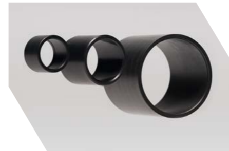
▲ APPLIANCE ROTOR SHAFT BUSHINGS

🛡️ Potential to achieve twice the operating lifetime of steel bushings.