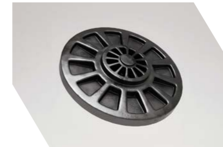
▲ REFRIGERATOR/AC COMPRESSOR DISCHARGE VALVE

🛡️ Potential to achieve twice the operating lifetime of steel bushings.