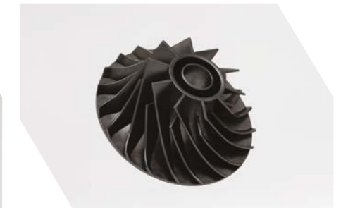
▲ VACUUM CLEANER SUCTION/BLOWER UNIT IMPELLERS

💡 Help the environment by reducing CO2 emissions by 148 kg/year: The same effect as planting 38 trees.